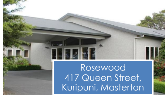
Rosewood 417 Queen Street, Kuripuni, Masterton